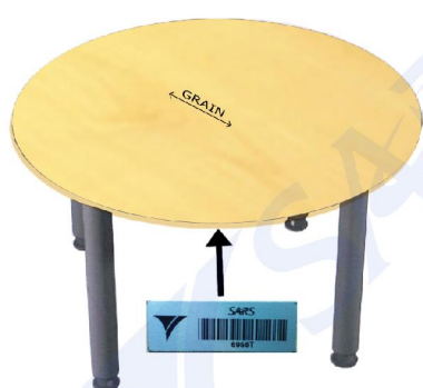
Typical 1200mm diameter 2/4 Seater Meeting Table

NOTE: Chair type for TABLE-01 is CHAIR-01-M-X